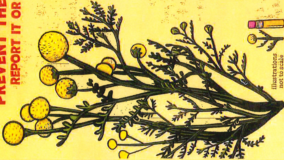
Illustrations not to scale

PREVENT THE SPREAD REPORT IT OR PULL IT!